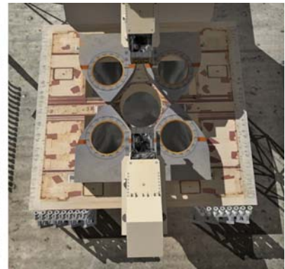
Holders for 4 boosters

For the Ariane 6 rocket 6.2 version (2 boosters) you must have these lines in your scenario file :