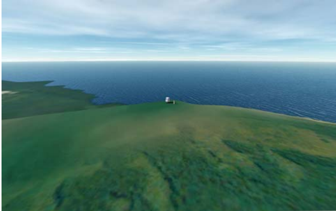
Without FRENCH GUIANA SURFACE TILES add-on

Here's a preview of what you'll see with or without this add-on.: