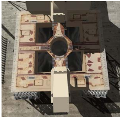
No booster holder

Note: These "palettes" do not appear in the vessel list if you press the F3 key.