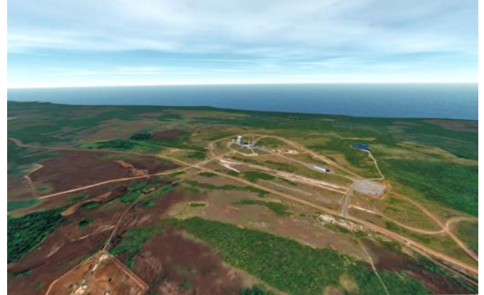
With FRENCH GUIANA SURFACE TILES add-on