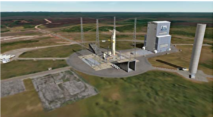
Without ARIANE 6 European Rockets add-on

Here's a preview of what you'll see with or without this add-on :