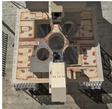
Holders for 2 booster