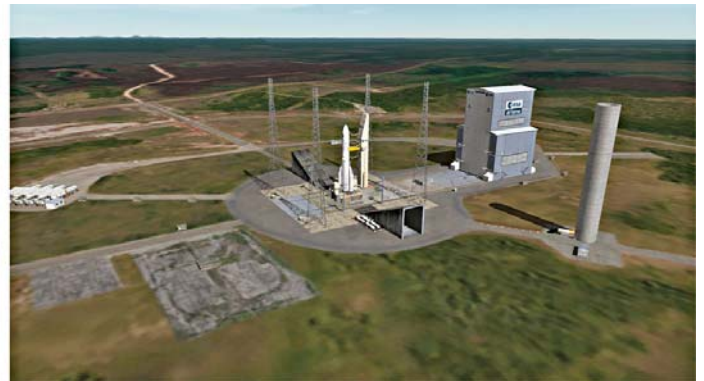
With ARIANE 6 European Rockets add-on